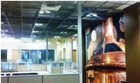
Mims Distributing, Raleigh, NC 20,000 sq.ft. headquarters renovation