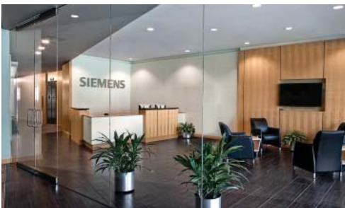
Siemens Medical Solutions, Cary, NC 150,000+ SF LEED Gold Certified office space